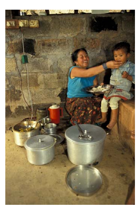
Figure 4: Low-wattage electrical cookers provide a clean environment and improve the load factor of microhydro schemes in Nepal.

Successful implementation of renewable energy schemes in rural areas is dependent upon a complex mixture of technological innovation combined with economical and institutional developments.